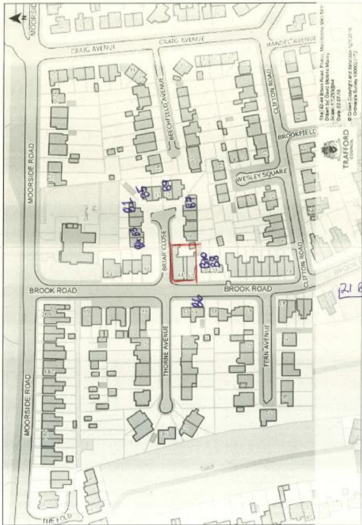
Licensing Act 2003 – Javes, 42-44 Brook Road, Urmston